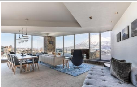
The Vale Niseko [Luxury]