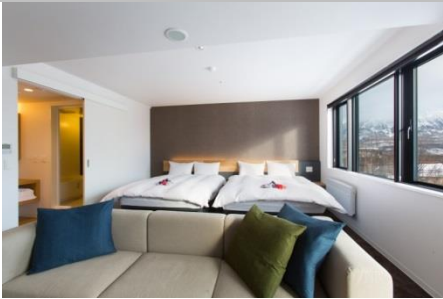
Always Niseko [Superior]