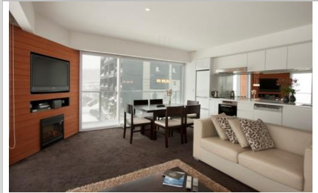
The Setsumon [Premium]