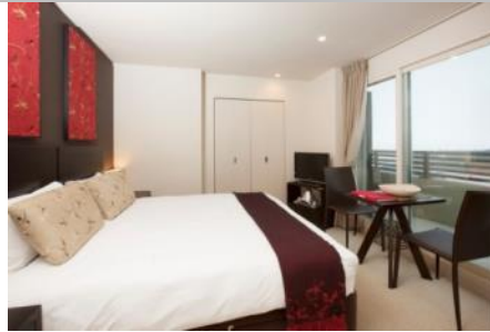
The Freshwater [Premium]