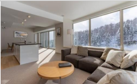
The Maples Niseko [Premium]