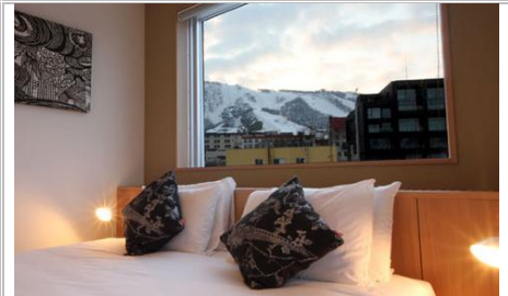
Snow Crystal [Premium]